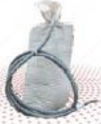
MAGNEZYUM ANOT 2LB.