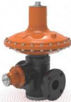
KAPASİTE TABLOSU (Stm 3 /h)