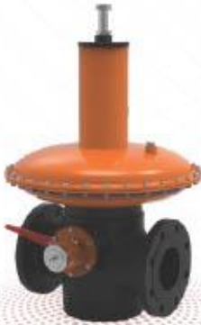
KAPASİTE TABLOSU (lsm 2 /h)